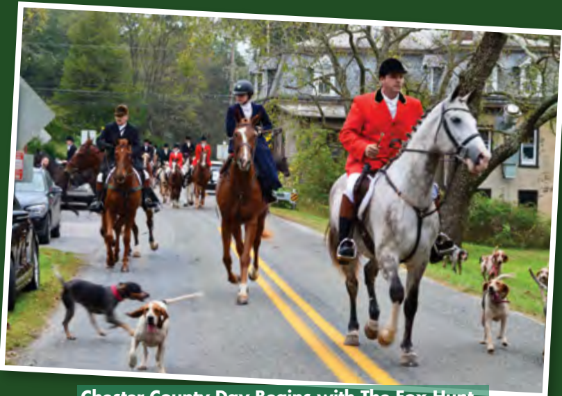
Chester County Day Begins with The Fox Hunt