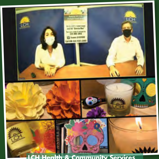
LCH Health & Community Services Virtual Fundraiser Amigos of LCH raised $53,000 to support direct services in their health centers.