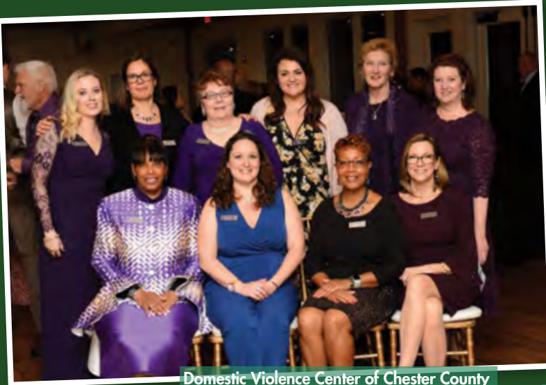
Domestic Violence Center of Chester County "All That's Purple Affair"