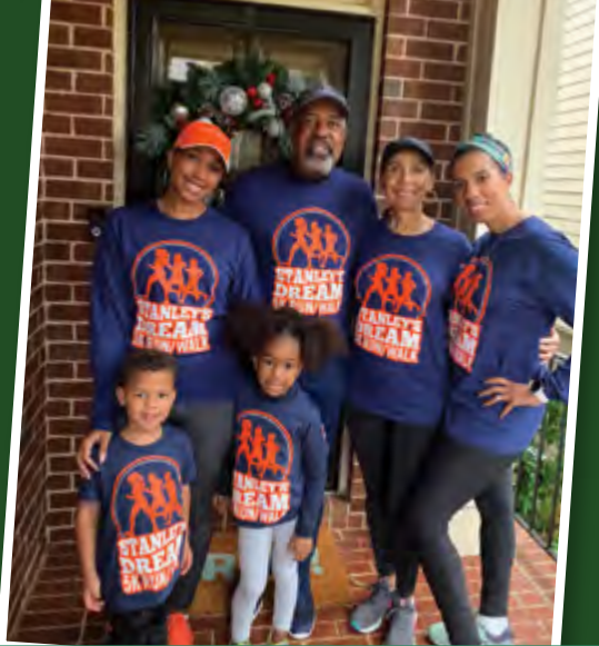
Stanley's Dream Foundation 5K Run/Walk Supporting childhood brain cancer research and scholarships.